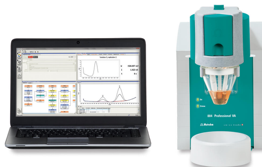
Figure 1. 884 Professional VA.

After diluting the sample in supporting electrolyte, the polarographic determination of lead is carried out on the 884 Professional VA with the Multi-Mode Electrode pro as working electrode using the parameters listed in Table 1 . The concentration of lead is determined by two additions of Pb standard addition solution.