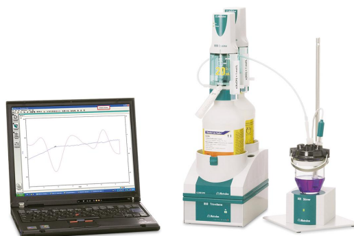
Figure 1. 859 Titrotherm setup for the thermometric titration and the data evaluation performed with tiamo.

The titration is based on the reaction between sodium hypochlorite and ammonium nitrogen and urea, respectively. Bromide is used as a catalyst for the reaction. As urea reacts more slowly with hypochlorite than ammoniacal nitrogen, two endpoints are obtained.