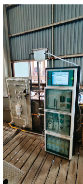
Figure 2. 2060 TI Process Analyzer with preconditioning panel in a zinc refining plant.

( Figure 2 ). Other combinations of measurements (e.g., pH), as well as measurement points taken from multiple streams, can be realized with this process analyzer.