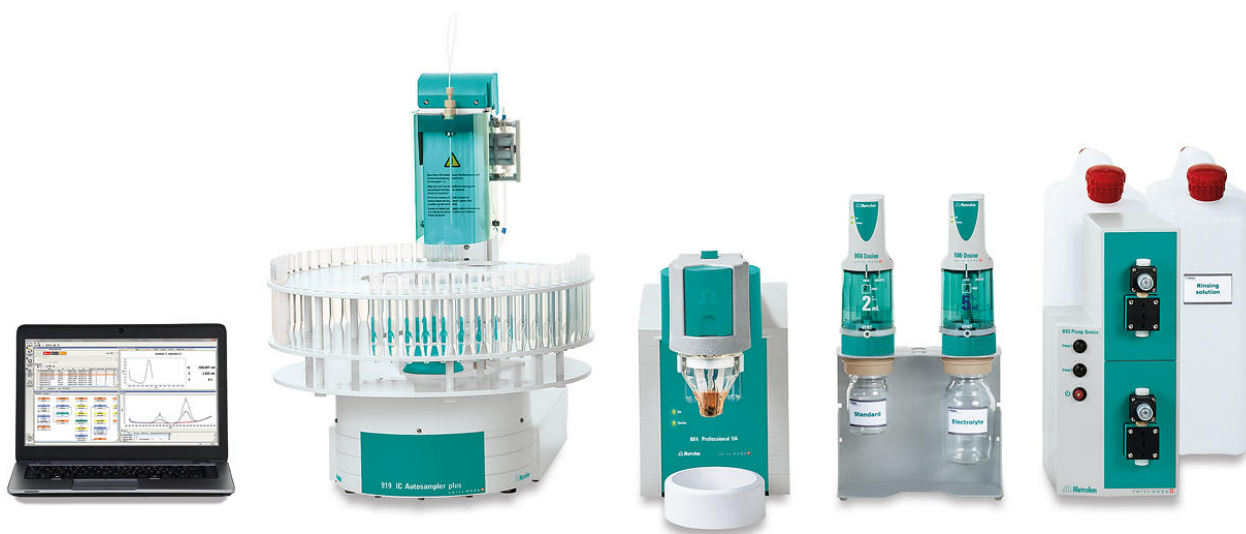
Figure 2. 884 Professional VA, fully automated for VA analysis