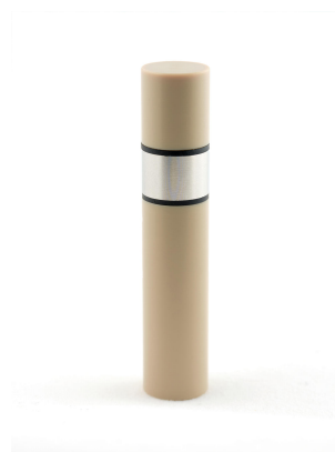
Figure 1. Rotating cylinder electrode showing the metallic insert, the Viton O-rings (black) and the PEEK holder.

In Figure 2 , the voltammograms resulting from the