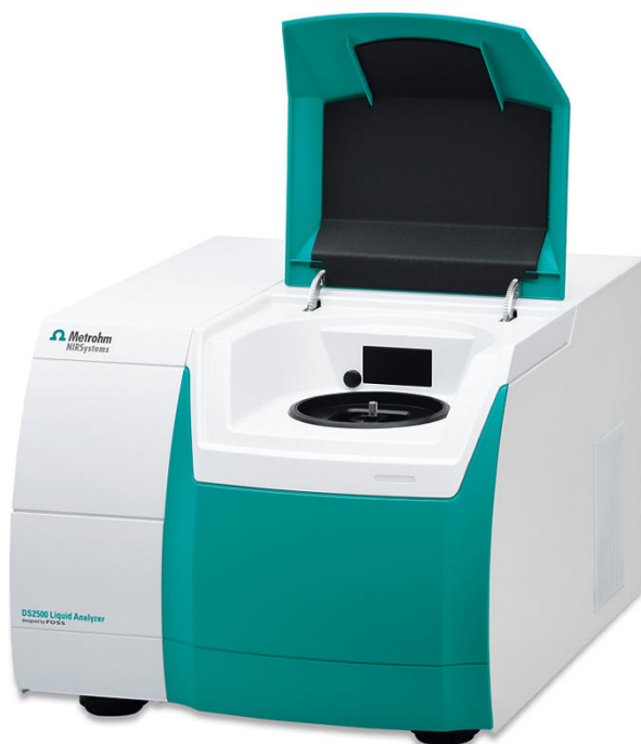
Figure 1. Metrohm DS2500 Liquid Analyzer used for the determination of research octane number (RON) in isomerate samples.