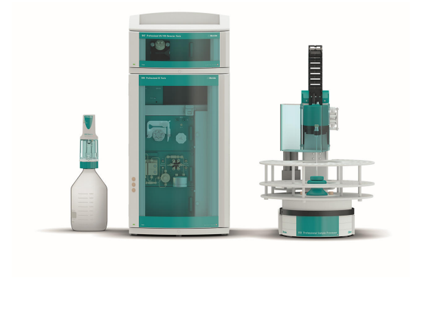
Figure 1. Instrumental setup including a 940 Professional IC Vario (center), 947 Professional UV/VIS Detector Vario SW (top center), 858 Professional Sample Processor (right), and MiPCT-ME, performed with the Metrosep A PCC 2 HC/4.0 and a Dosino (left).

The sample was analyzed with a chromatographic separation technique as described in USP <621> [3] (Figure 1). A MiPCT-ME setup was used in conjunction with the method parameters in Table 1. A 2 mL sample was preconcentrated on a Metrosep A PCC 2 HC/4.0, and the matrix was eliminated with 3 mL of ultrapure water. After injection, the anionic components were isocratically separated within 45 minutes on a Metrosep A Supp 10 - 250/4.0 column. The UV/VIS detector signal was recorded at 215 nm. Confirmation of the method accuracy was done with a spiking study. The sample was spiked with a nitrite standard at two concentration levels (1.0 µg/L and 4 µg/L), and the recovery values were evaluated.