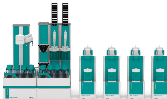
Figure 1. The OMNIS Sample Robot S equipped with an OMNIS Professional Titrator, plus a corresponding amount of OMNIS Dosing Modules to add all necessary solutions, and dPt Titrode for the automated determination of iodine value.