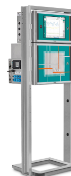
Figure 2. The 2060 The NIR-Ex Analyzer from Metrohm Process Analytics is suitable for use in hazardous areas.

Metrohm Process Analytics manufactures NIRS process analyzers that gather «real-time» spectral data from the process. These are used for comparison to a primary method (e.g., Karl Fischer titration) to create a simple, yet indispensable model to easily monitor QC parameters in near real-time. Gain more control over the refining process with a 2060 The NIR-Ex Analyzer configured for applications in ATEX zones (Figure 2). This process analyzer is capable of monitoring up to five sample points per NIR cabinet with the multiplexer option.