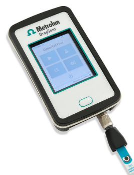
Figure 1. The DROPSTATPLUS instrument and CASTDIR used to connect screen-printed electrodes.

DROPSTATPLUS is a custom potentiostat-based electrochemical reader that is configured according to the specific needs of each user. By specifying the electrochemical technique and its parameters as well as the calibration curve, it is possible for a single instrument to automatically display the concentration of the analyte for which the electrochemical sensor has been developed directly on an LCD screen. All hardware used for this study is compiled in Table 1.