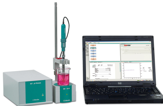
Figure 1. 867 pH Module for precise and reliable ion measurement.

This analysis is carried out automatically on an 867 pH Module equipped with an Ag/S ion selective electrode, a reference electrode, and a temperature sensor. The sensor is calibrated prior to the analysis. To the prepared sample, sulfide antioxidant buffer is added and stirred for 3 minutes to free bound sulfide. Afterwards, the sensors are placed into the sample and the sulfide concentration is measured.