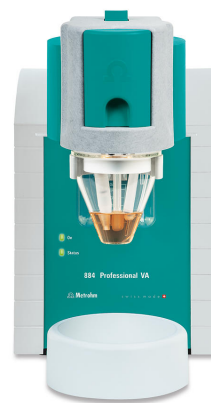
Figure 1. 884 Professional VA manual for MME.

Add the water sample to a vessel filled with degassed electrolyte. Use two standard additions with separate Fe(II) and Fe(III) standard solutions to perform the quantification.