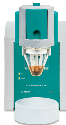
Figure 1. 884 Professional VA manual for MME

Add the sample and the electrolyte solution into the measuring vessel and degas it for 5 min. The interfering effect of chloride is mitigated through the addition of masking analyte. The determination is carried out using parameters listed in Table 1 . Quantification is done with the 884 Professional VA manual for MME ( Figure 1 ) using two standard additions with thiourea standard addition solutions.