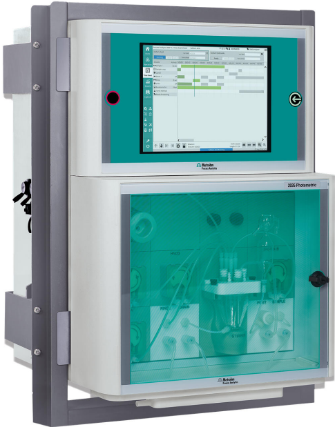
Figure 2. 2035 Process Analyzer - Potentiometric for accurate online determination of ammonia in brine streams.

calculated as ammonia using a 2035 Process Analyzer - Potentiometric (Figure 2).