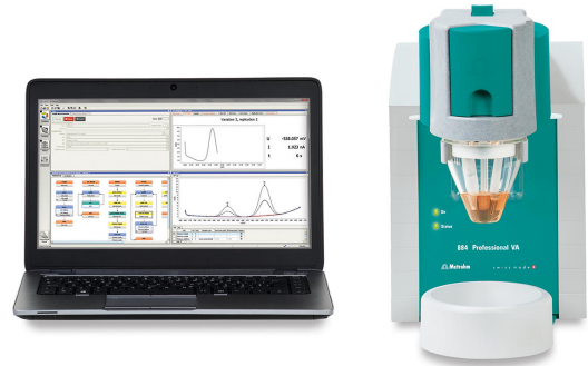
Figure 1. 884 Professional VA.

After diluting the sample in supporting electrolyte, the polarographic determination of lead is carried out on the 884 Professional VA with the Multi-Mode Electrode pro as working electrode using the parameters listed in Table 1 . The concentration of lead is determined by two additions of Pb standard addition solution.