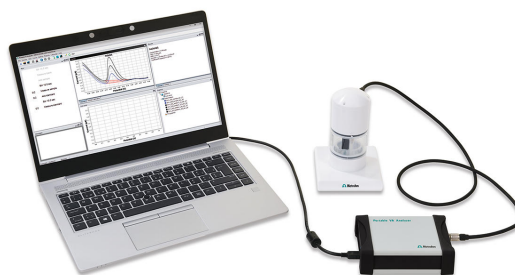
Figure 1. 946 Portable VA Analyzer

The scTRACE Gold is electrochemically activated prior to the first determination.