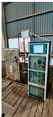
Figure 2. 2060 TI Process Analyzer with preconditioning panel in a zinc refining plant.

( Figure 2 ). Other combinations of measurements (e.g., pH), as well as measurement points taken from multiple streams, can be realized with this process analyzer.