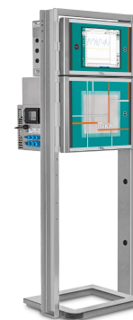
Figure 2. The 2060 The NIR-Ex Analyzer from Metrohm Process Analytics is suitable for use in hazardous areas.

Metrohm Process Analytics manufactures NIRS process analyzers that gather «real-time» spectral data from the process. These are used for comparison to a primary method (e.g., Karl Fischer titration) to create a simple, yet indispensable model to easily monitor QC parameters in near real-time. Gain more control over the refining process with a 2060 The NIR-Ex Analyzer configured for applications in ATEX zones (Figure 2). This process analyzer is capable of monitoring up to five sample points per NIR cabinet with the multiplexer option.