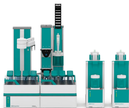
Figure 1. Sample Robot S with Dis-Cover functionality, Dosing module, and OMNIS Advanced Titrator equipped with dPt Titrode for the determination of peroxide value in edible oils.

To a reasonable amount of sample, both a solvent mixture (containing acetic acid) and auxiliary solution (saturated potassium iodide solution) are automatically added. Afterward, the resulting solution is stirred for one minute to complete the reaction. Deionized water is added and the sample is titrated with standardized sodium thiosulfate until after the equivalence point is reached.