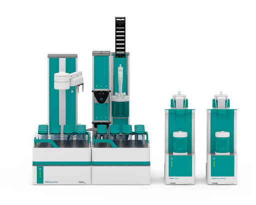
Figure 1. Fully automated OMNIS system for the determination of acid value in edible oils.

To a reasonable amount of sample, a solvent mixture consisting of ethanol and diethyl ether is automatically added, and the solution is stirred for one minute to dissolve the sample. Afterwards, the sample is titrated with standardized ethanolic KOH until after the equivalence point.