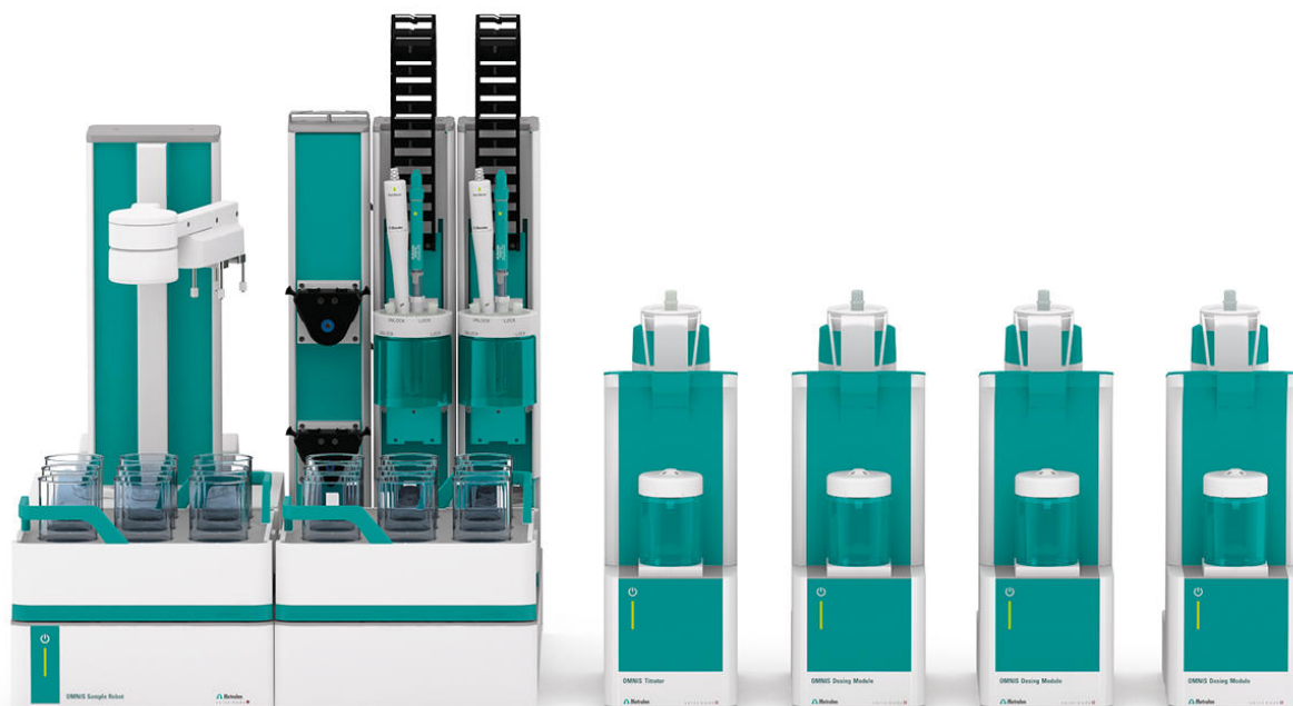
Figure 1. OMNIS Sample Robot S with an OMNIS Titrator and three Dosing Modules. Not pictured: additional OMNIS Sample Robot with Titrator and Dosing Modules as well as required Dosing Interface and Dosinos.