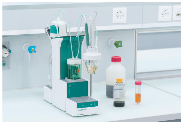
Figure 1. OMNIS Titrator Professional equipped with a dThermoprobe and a rod stirrer.

An appropriate amount of sample is weighed into the titration vessel, and solvent as well as paraformaldehyde are added. Afterwards, the solution is titrated until after the first exothermic endpoint with standardized potassium hydroxide (Figure 2).