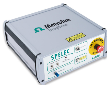
Figure 2. The SPELEC-RAMAN used for the measurements in the application note.

Screen-printed electrodes (refs. DRP-110, DRP-110SWCNT, DRP-110CNT, DRP-110OMC, DRP-110GPH, DRP-110CNF) were placed in a specific cell for this type of devices (DRP-RAMANCELL) coupled with the DRP-RAMANPROBE, which allows to perform the Raman measurements of the electrode surface at optimal focal distance. Integration time was 20 s.