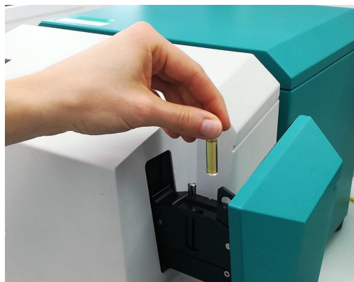
Figure 1. XDS RapidLiquid Analyzer and a polyol sample present in a 4 mm disposable vial.

Polyol samples were measured with the XDS RapidLiquid Analyzer in transmission mode over the full wavelength range (400–2500 nm). Reproducible spectrum acquisition was achieved using the built-in temperature control (at 30 °C) of the XDS RapidLiquid Analyzer. For convenience, disposable vials with a path length of 4 mm were used, which made cleaning of the sample vessels unnecessary. The Metrohm software package Vision Air Complete was used for all data acquisition and prediction model development.