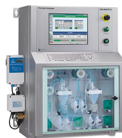
Figure 2. The Metrohm Process Analytics ADI 2045TI Ex proof (ATEX) Process Analyzer.

Hydrogen peroxide is analyzed by using a complexing agent followed by a colorimetric measurement with dipping probe.