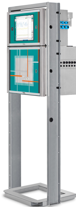
Figure 3. 2060 The NIR Analyzer from Metrohm Process Analytics.