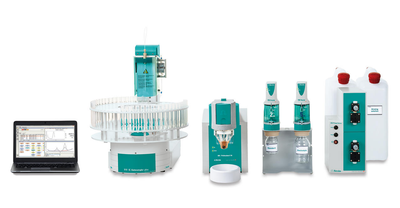
Figure 1. 884 Professional VA fully automated for VA

is determined by two additions of an iron standard addition solution. The Bi drop electrode is electrochemically activated prior to the first determination.