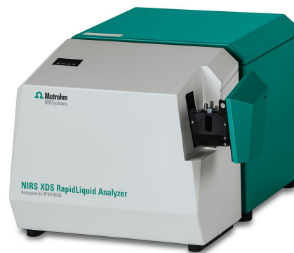
Figure 1. The NIRS XDS RapidLiquid Analyzer with a 1 mm quartz cuvette, used to collect the spectra of surfactant samples.

A total of 37 samples with varying surfactant content were provided by a customer. The Vis-NIR spectra (Figure 2) were acquired on a Metrohm NIRS XDS RapidLiquid Analyzer equipped with 1 mm quartz cuvette (Figure 1). The samples were measured as-is, without any sample preparation steps. Data collection and model development was carried out with the Vision Air complete software package.