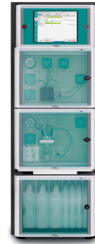
Figure 2. 2060 Process Analyzer for online analysis of ammonia and hydrogen sulfide in the sour water stripping process.

The 2060 Process Analyzer can analyze H 2 S and NH 3 simultaneously with automatic cleaning and calibration steps using absolute wet chemical techniques. Sulfide (S 2- ) is determined by a precipitation titration with silver nitrate (AgNO 3 ). Ammonia is determined by Dynamic Standard Addition (DSA). Fast and accurate results are continuously transmitted to the programmable logic controller (PLC) for process control.