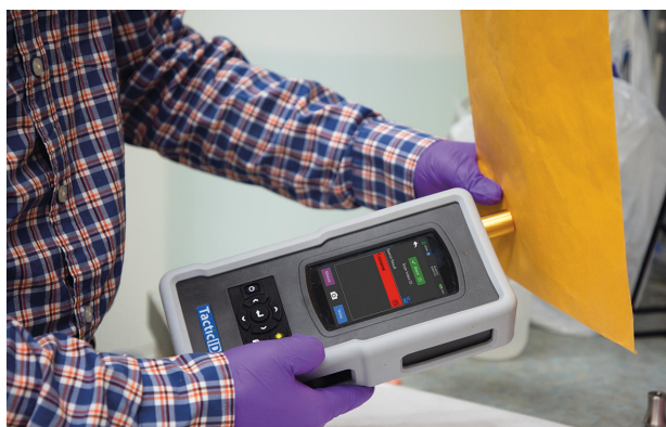
Figure 1. TacticID-1064 ST measuring a sample through a manila envelope with ST adapter