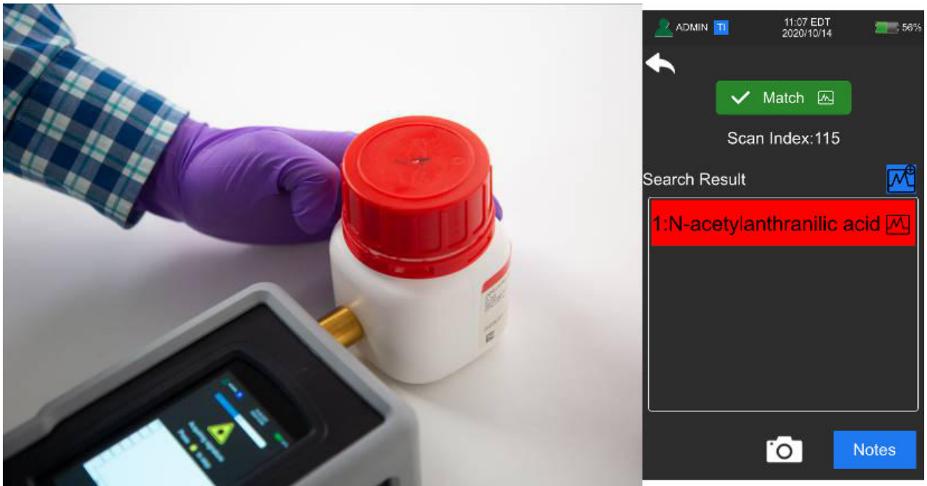
Figure 4. TacticID-1064 ST measurement through HDPE bottle and match result for N-acetylanthranilic acid

Caffeine in a white plastic bottle was placed inside a white padded shipping package for analysis (Figure 5). In this case, the caffeine must be identified through both the plastic and the padded package.