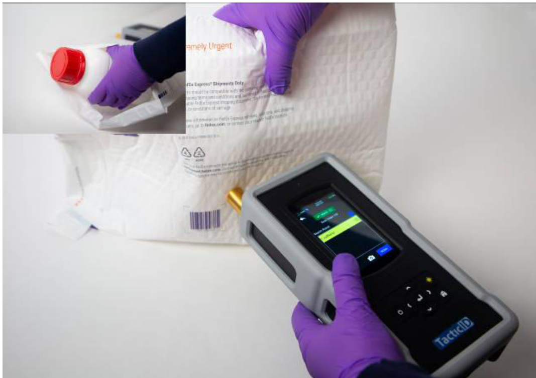
Figure 5. Measurement of white HDPE bottle of caffeine inside white padded package