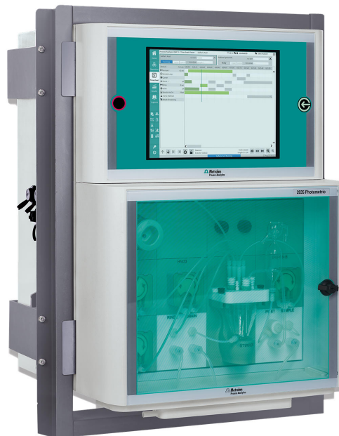
Figure 2. 2035 Process Analyzer - Potentiometric for accurate online determination of ammonia in brine streams.

calculated as ammonia using a 2035 Process Analyzer - Potentiometric (Figure 2).