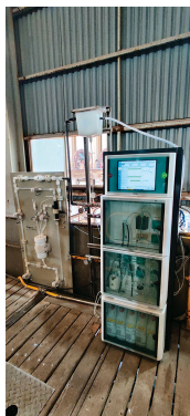
Figure 2. 2060 TI Process Analyzer with preconditioning panel in a zinc refining plant.

( Figure 2 ). Other combinations of measurements (e.g., pH), as well as measurement points taken from multiple streams, can be realized with this process analyzer.