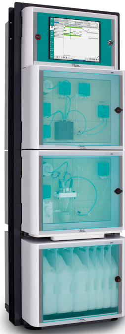
Figure 2. 2060 TI Process Analyzer for the online analysis of critical quality parameters in pickling baths using the method of titration.

Metrohm Process Analytics offers a multi-parameter process analyzer that is suitable for the simultaneous analysis of \text{Fe}^{2+}/\text{Fe}^{3+} and free acid/total acid ratio over a wide concentration range—the 2060 TI Process Analyzer (Figure 2).