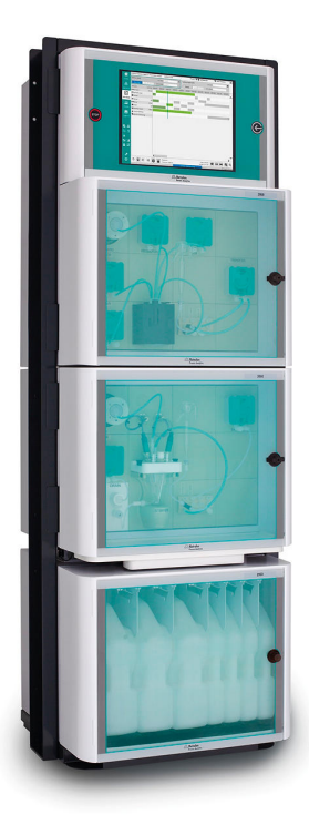
Figure 2. 2060 TI Process Analyzer used for online monitoring of hydrogen peroxide in salmon delousing baths.