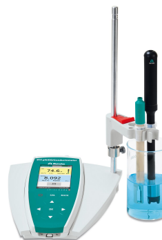
Figure 1. 914 pH/DO/Conductometer equipped with an O 2 -Lumitrode for the determination of dissolved oxygen in juices.

The prepared sample is carefully opened and the O 2 -Lumitrode is placed directly into the sample. The measurement is started, and the DO content is measured until a stable value is reached. Afterwards, the sensor is removed and rinsed well with deionized water. If necessary, blot dry. For each analysis, a new sample bottle is opened. The sensor is stored dry with mounted calibration vessel for protection.