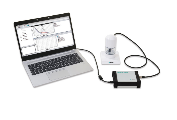
Figure 1. 946 Portable VA Analyzer

The scTRACE Gold is electrochemically activated prior to the first determination.