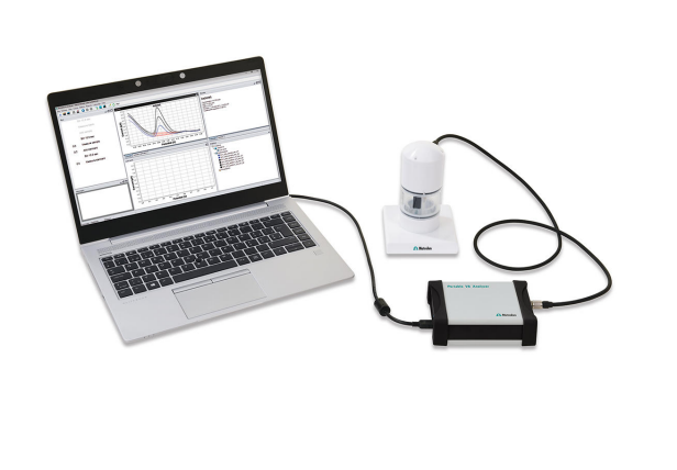
Figure 1. 946 Portable VA Analyzer

Prior to the first determination, the ex-situ mercury film is deposited on the scTRACE Gold electrode. In the next step, the electrodes are cleaned with ultrapure water and the measuring vessel is emptied. The water sample, the supporting electrolyte with the complexing agent (DTPA) are pipetted into the measuring vessel. The determination of chromium(VI) is carried out with a 946 Portable VA Analyzer using the parameters specified in Table 1 . The concentration is determined by two additions of a chromium(VI) standard addition solution. The scTRACE Gold is electrochemically activated prior to the first determination.