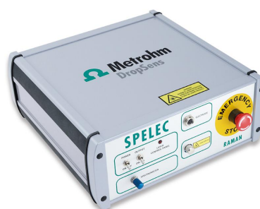
Figure 2. The SPELEC-RAMAN used for the measurements in the application note.

Screen-printed electrodes (refs. DRP-110, DRP-110SWCNT, DRP-110CNT, DRP-110OMC, DRP-110GPH, DRP-110CNF) were placed in a specific cell for this type of devices (DRP-RAMANCELL) coupled with the DRP-RAMANPROBE, which allows to perform the Raman measurements of the electrode surface at optimal focal distance. Integration time was 20 s.