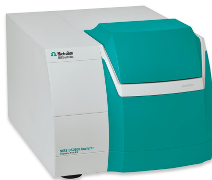
Figure 1. DS2500 Solid Analyzer

Several 250 µm PVC foils coated with a PVDC layer of varying thickness (40 g/m 2 , 60 g/m 2 , 90 g/m 2 ) were measured on the DS2500 Solid Analyzer. The measurements were carried out in transfection mode using the NIRS gold diffuse reflector with 1 mm pathlength. This ensures that the spectral pathlength is constant while enhancing the spectral signal. The Metrohm software package Vision Air Complete was used for all data acquisition and prediction model development.