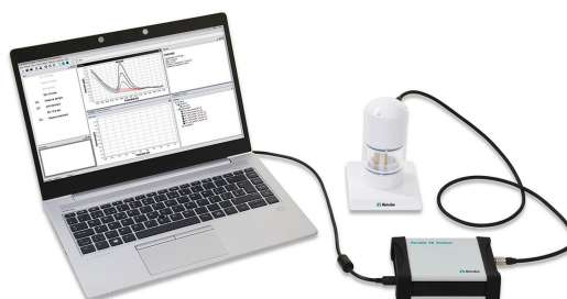
Figure 1. 946 Portable VA Analyzer (SPE)

Prior to the first determination, the ex-situ mercury film is deposited in a separate step on the screenprinted electrode. The water sample and the supporting electrolyte are pipetted into the measuring vessel. The simultaneous determination of cadmium and lead is carried out with the 884 Professional VA or with the 946 Portable VA Analyzer using the parameters specified in Table 1 . The concentration of both elements is determined by two additions of a cadmium and lead standard addition solution.