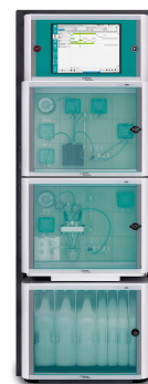
Figure 2. 2060 Process Analyzer for online analysis of ammonia and hydrogen sulfide in the sour water stripping process.

The 2060 Process Analyzer can analyze H 2 S and NH 3 simultaneously with automatic cleaning and calibration steps using absolute wet chemical techniques. Sulfide (S 2- ) is determined by a precipitation titration with silver nitrate (AgNO 3 ). Ammonia is determined by Dynamic Standard Addition (DSA). Fast and accurate results are continuously transmitted to the programmable logic controller (PLC) for process control.