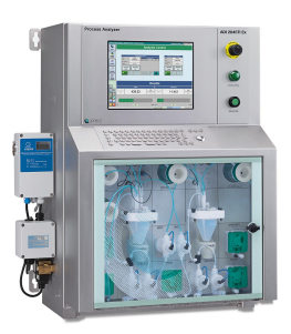
Figure 2. The Metrohm Process Analytics ADI 2045TI Ex proof (ATEX) Process Analyzer.

Hydrogen peroxide is analyzed by using a complexing agent followed by a colorimetric measurement with dipping probe.