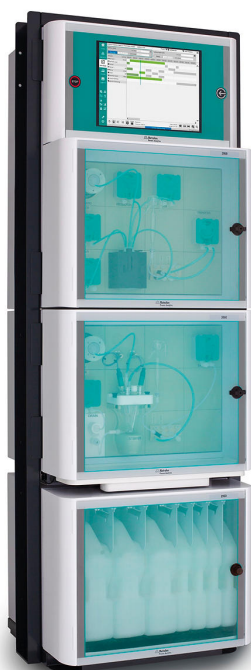
Figure 2. 2060 TI Process Analyzer for the online analysis of critical quality parameters in pickling baths using the method of titration.

Metrohm Process Analytics offers a multi-parameter process analyzer that is suitable for the simultaneous analysis of \text{Fe}^{2+}/\text{Fe}^{3+} and free acid/total acid ratio over a wide concentration range—the 2060 TI Process Analyzer (Figure 2).