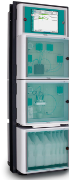
Figure 2. 2060 Process Analyzer from Metrohm for online monitoring of hydrogen peroxide during the CMP process.

Other combinations of measurements, as well as measurement points taken from a single process stream or even multiple streams, can be realized across the Metrohm Process Analytics product portfolio. All platforms guarantee fast, accurate results continuously available for true process control.