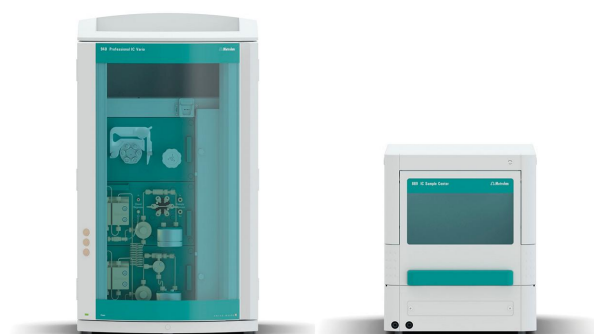
Figure 1 Instrumental setup including a 940 Professional IC Vario with a binary high-pressure gradient and conductivity detection after chemical suppression (L), and an 889 IC Sample Center – cool (R). Cooling can prolong sample stability.

Out of the stock solution, the sample solutions with a nominal concentration of 100 µg/mL NaCl were prepared by dilution with UPW. Here, 10 mL of sample stock solution was transferred to a 500 mL volumetric flask, diluted to volume, and mixed well. A single point calibration with 100 µg/mL of USP Sodium Chloride RS in UPW was used.