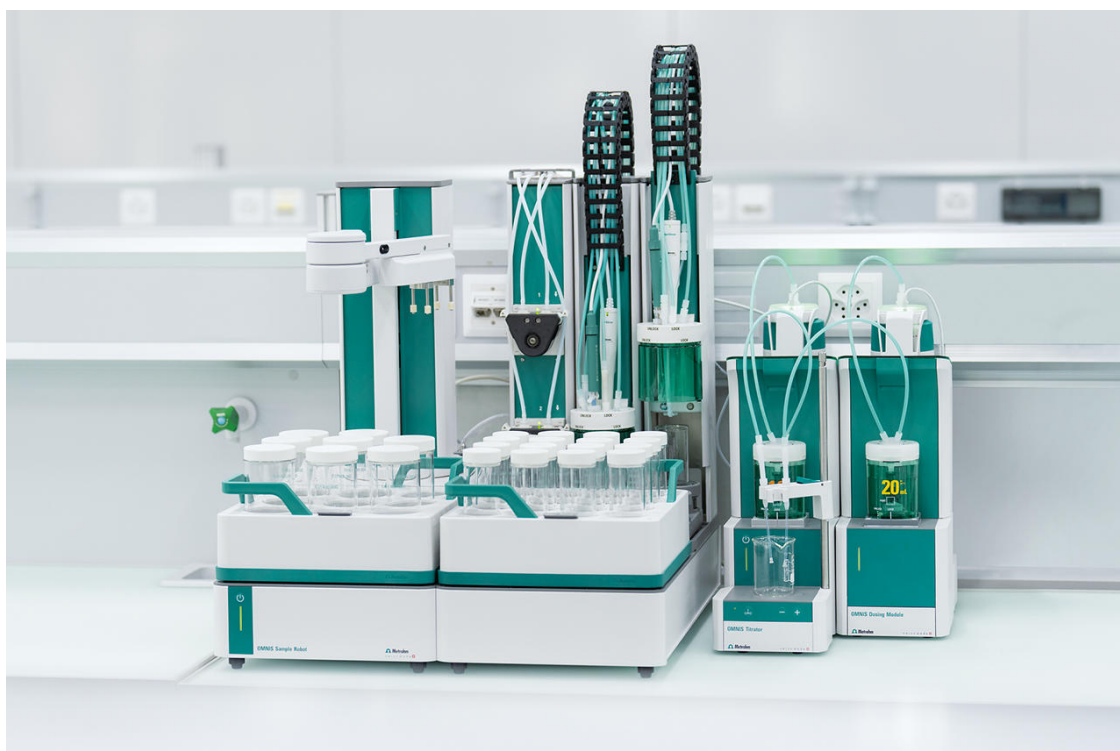
Figure 1. OMNIS Sample Robot S equipped with an OMNIS Titrator, Dosing module, and dUnitrode electrode for the automated determination of pyrophosphate in aqueous samples.

The determination is carried out with an OMNIS Titrator equipped with a dUnitrode on an OMNIS Sample Robot S (Figure 1).