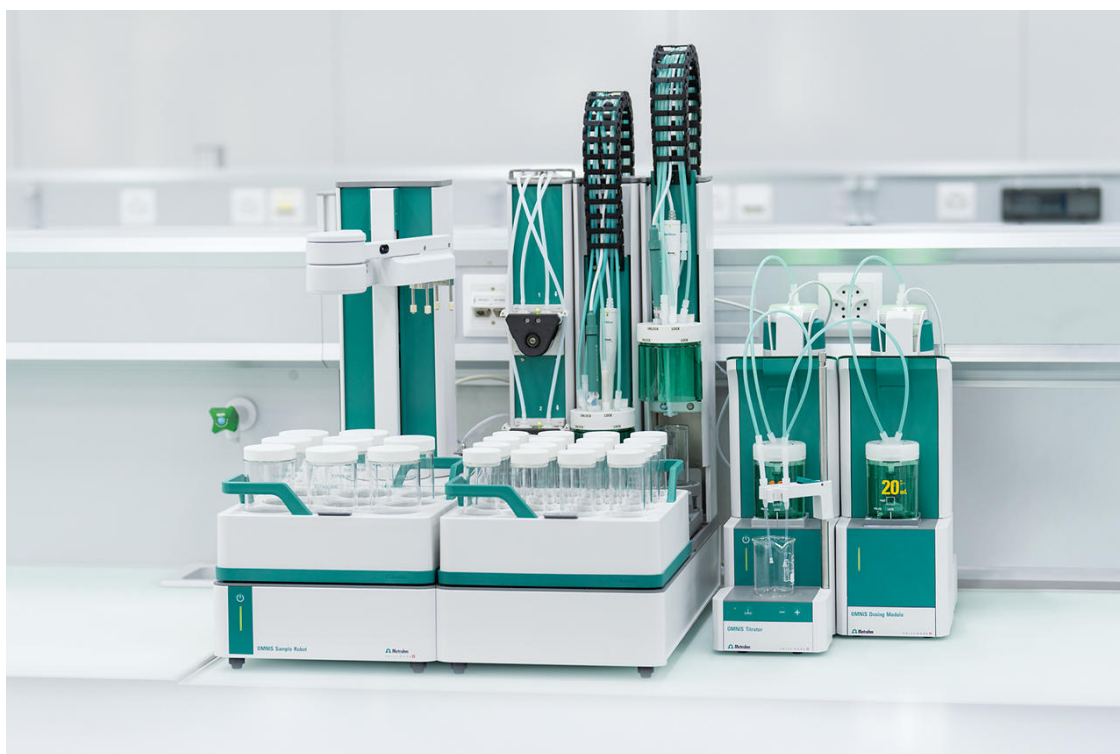
Figure 1. OMNIS Sample Robot S equipped with an OMNIS Titrator, Dosing module, and dUnitrode electrode for the automated determination of pyrophosphate in aqueous samples.

The determination is carried out with an OMNIS Titrator equipped with a dUnitrode on an OMNIS Sample Robot S (Figure 1).