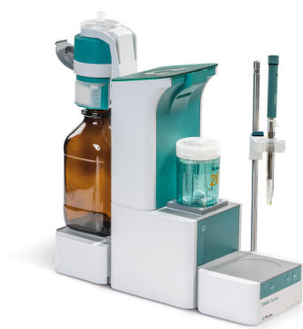
Figure 1. OMNIS Professional Titrator equipped with a dUnitrode with integrated Pt1000.

An appropriate amount of water is pipetted into the titration beaker. After pH measurement, the p- and m-values are determined with fixed endpoints (FP) at pH 8.2 and 4.5 using standardized hydrochloric acid.