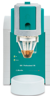
Figure 1. 884 Professional VA manual for MME.

The lfp sample is weighed, mixed with degassed diluted sulfuric acid, heated at 85 °C for 15 minutes, and then cooled. Afterward, the digested sample solution is added to the measuring vessel that contains 20 mL degassed electrolyte. Quantification is done using two standard additions with separate Fe(II) and Fe(III) solutions.