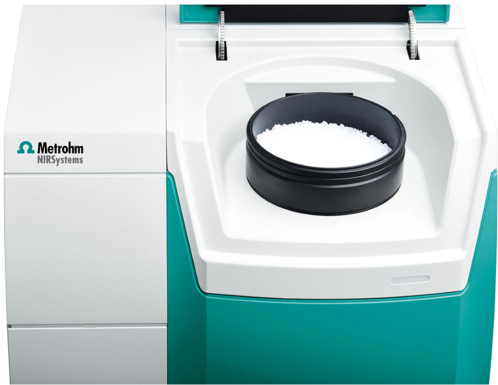
Figure 1. Metrohm DS2500 Solid Analyzer with the DS2500 large sample cup for measuring the intrinsic viscosity of recycled polyethylene terephthalate (rPET).

spectra. This setup with the large sample cup reduces the influence of the particle size distribution of the polymer pellets ( Figure 1 ). Data acquisition and prediction model development was performed with the software package Vision Air Complete.