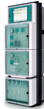
Figure 2. 2060 TI Process Analyzer.

By integrating online process analyzers into the refinery, operators can quickly check the cyanide levels in the leaching process and in the wastewater effluent. This helps them make corrections to improve efficiency and reduce harm to the environment.